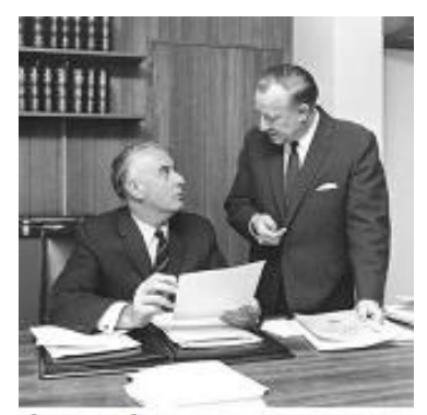
duumvirate government (means ministry of two)

"Be it enacted by the Queen's Most Excellent Majesty, the Senate and the House of Representatives of the Commonwealth of Australia .."