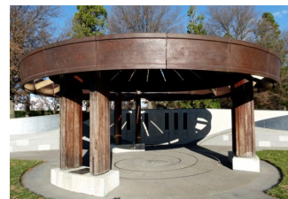
Magna Carta Place Canberra

And it was there when Simon de Montfort brought together the very first Parliament in 1265, making England truly, the 'Mother of Parliaments'.